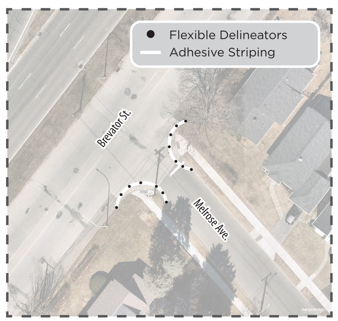
Note 1. Proposed curb extensions will provide at least 20 feet for driving lanes. Note 2. Curb extensions should not extend > 6 feet from the intersection.